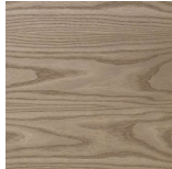
Ash Wood/Tobacco/Ch ampagne